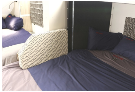
New patented and industry first "Quick-Fold" Side Bed