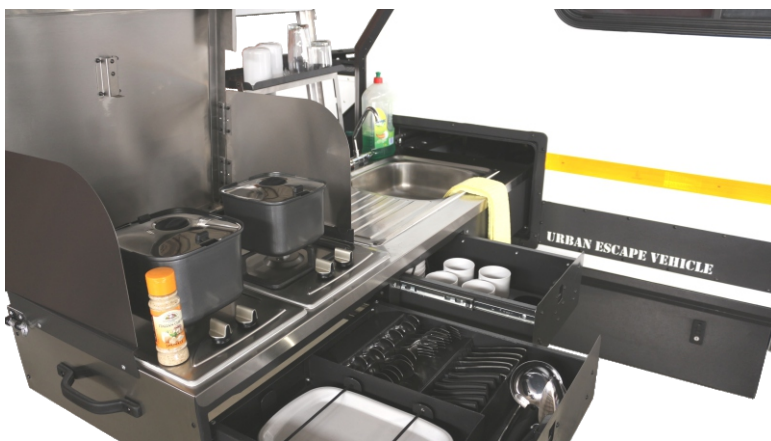
Conveniently laid-out kitchen, with instant hot water wash-up facility, integrated drying rack and easy to reach fridge.