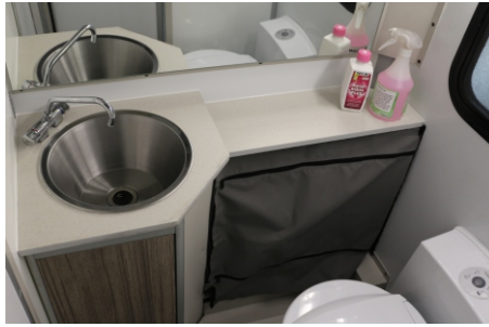
Interior bathroom with Hot & Cold water and cassette toilet.