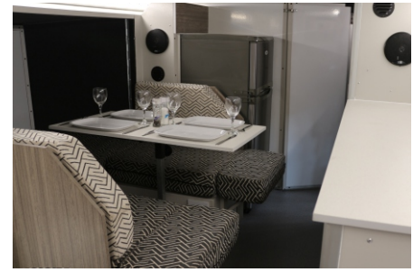
Side bed converts into a 4 seater Dinette. Double door Stand-up Fridge Freezer