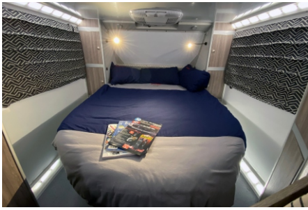
Comfortable Island Style Double Bed