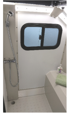
Spacious internal shower with Hot & Cold water