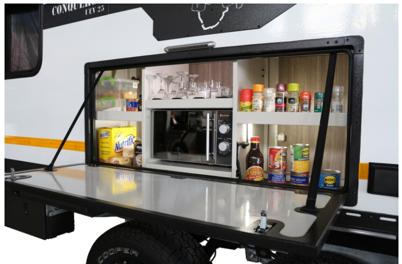
Large 315L Grocery Cupboard and work surfaces for those night and day time snacks.